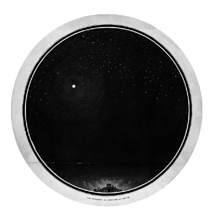
Figure 3: Cenotaph for Newton, 1784, Etienne Louis Boullee.

in this sense. In both cases there is a strategic blurring that implies a relationship of infinity. The Cartier Foundation uses the contemporary resource of the reflection and transparency of glass in the contemporary metropolis to evoke a picturesque world that arises inside a plot whose garden is the real object of work. As if they were large fragments of the curtain wall industry, an organization of parallel glass planes dissolve the body of the building almost completely. As if the whole building were just a deep facade, or a screen that reflects the world that surrounds it, Nouvel's project, above all, builds the illusion of a garden lost among the images of the city. Included so many times among examples of atmospheric architecture, the Cartier Foundation exemplifies something more than a dissolution of objectuality in architecture, architecture as surface or the infinity of atmospheric space, it also implies a link to the contemporary of the image summarized in the flat and polished in which our contemporaneity looks. It is a prefigured space of what little later floods our daily reality: the screen in which the world is presented to us. It shows the complex aesthetic framework in which the condition of the contemporary manifests itself between the effects and modes, in a condition of environment or the atmosphere as a form. Where has the historical material opacity of architecture remained in this formal simplicity and tremendous conceptual complexity?