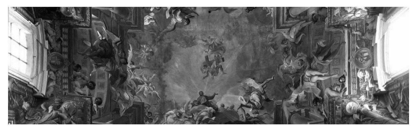
Figure 2: Allegory of the jesuits missionary work, detail, Andrea Pozzo, 1650, Sant'Ignazio, Rome, Italy

environmental school<sup>15</sup> and were perhaps still moved by the still-relevant aesthetic environments of Impressionism and Expressionism, approached the subject in several ways without being able to confine it into a stable body for theory. The irruption of rational positivism in architecture, <sup>16</sup> which would underpin the "modern project," frustrated the opportunity of expressionism represented in the works of Bruno Taut and Paul Scheerbart – an unexplored reef to which Iñaki Ábalos has called the "repressed image"<sup>17</sup> of the modern project.