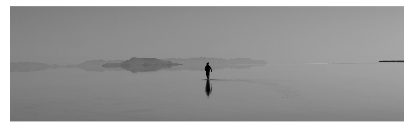
Figure 1: Walking over Salt Flats, Wendover, Utah, Great Salt Lake, 2016